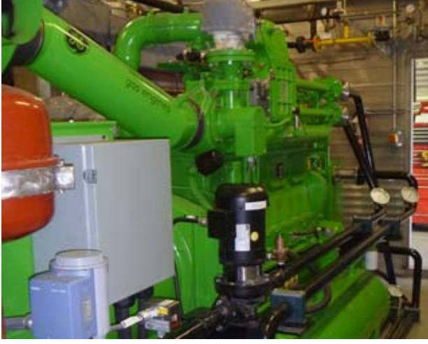
239 kWe Jenbacher Engine at PDC

The successful start-up of the system at UBC represents the culmination of more than four years of product development work and collaboration with GE's Gas Engines Division. Prior to installing the 2 MW gas engine at UBC, Nexterra successfully completed more than 5,000 hours of trials at its Product Development Centre (PDC) in Kamloops, BC, including over 3,000 hours utilizing a 239 kWe Jenbacher engine.